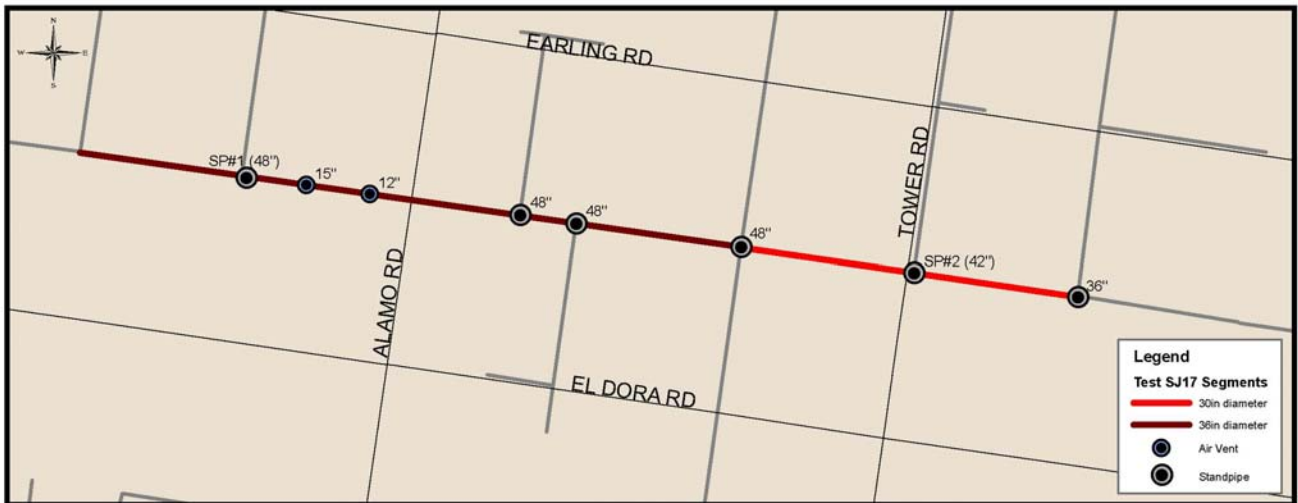
Figure 4. Detailed map of Test SJ17