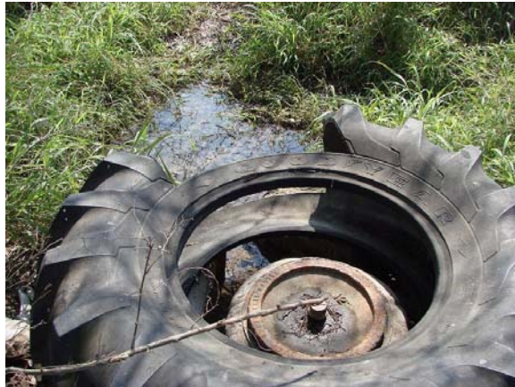
Figure 7. Leaking from turnout valve

These tests were performed under the district's normal operating water levels, with all downstream check-gates and turnout valves closed. Once the pipeline was filled, the head gates were shut and water surface elevations were measured at selected standpipe stations with measuring tapes and a water sounding meter and referenced to the inside top rim of the standpipe (Figure 8). Each test lasted between 1.0 to 1.5 hours, recording water level measurements at 10 minute intervals (8-10 measurements per test).