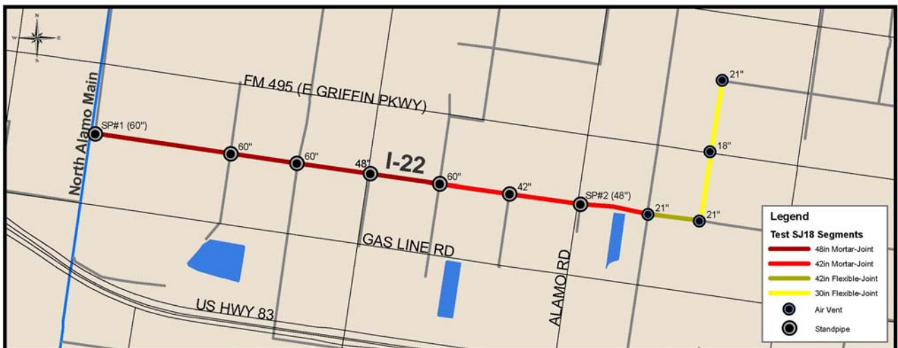
Figure 5. Detailed map of Test SJ18