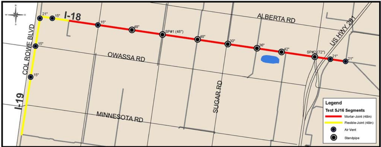
Figure 3. Detailed map of Test SJ16