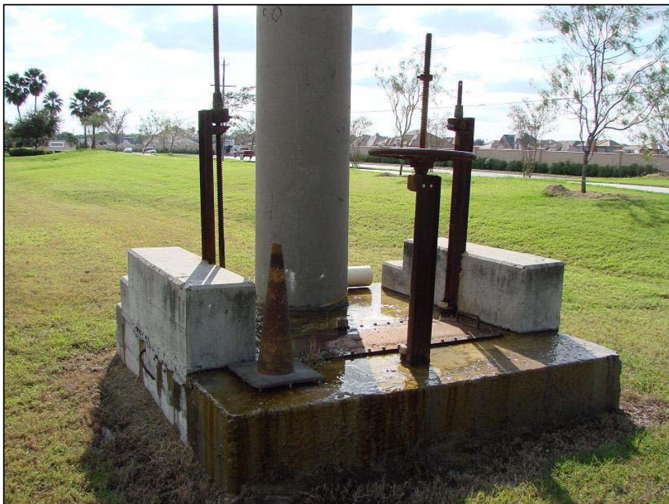
Figure 1. Leaking pipeline control structure

Figure 1 shows a leaking pipeline control structure and standpipe with lateral gates that were shut-off during the test.