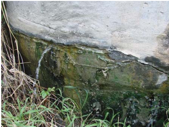
Figure 6. Leaking from standpipe

The pipelines were tested using the ponding method. These tests accounted for all the leaks occurring from gates, valves, and pipeline joints that are either undetectable or are difficult to measure (figures 6 and 7), classified as total loss tests; thus, measuring the total water loss rate.