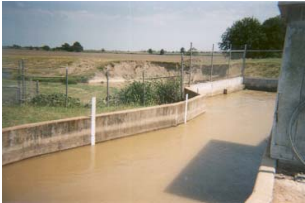
Figure 1: 10 foot Parshall flume and water level of flow measurement on May 16, 2003.

Milton Henry visited the site on April 11, 2003, met with Chad Elms, manager of the district, and provided preliminary assessment notes. The pump was not operating at this time, and a second visit was scheduled in order to observe the flume under normal conditions. Milton noted that no staff gages existed at the site.